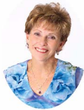
“The Attitude Doc”